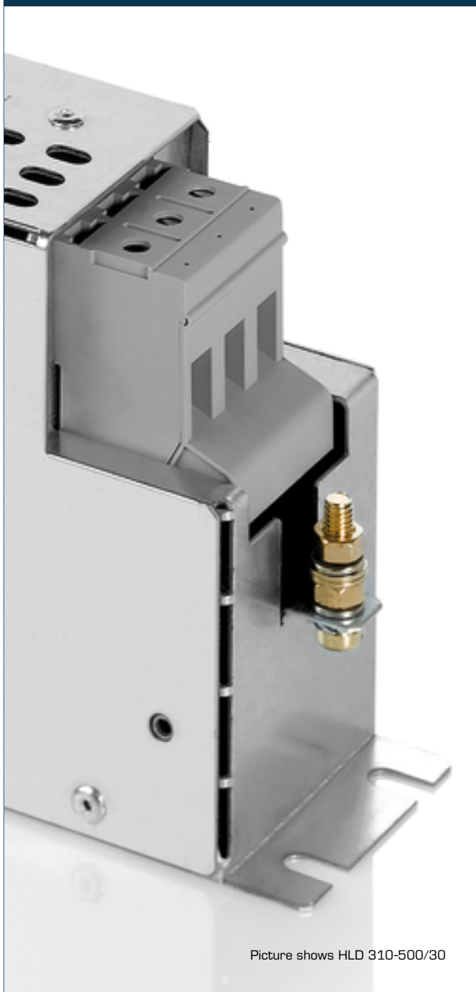
Picture shows HLD 310-500/30